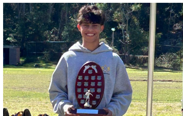
Spirit of KWP Dilan