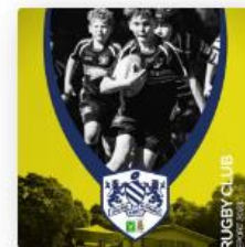
2023 Annual Report