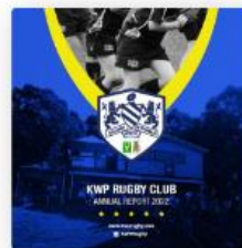
2022 Annual Report