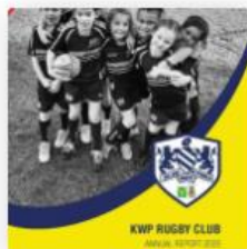
2020 Annual Report