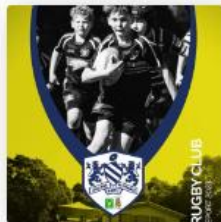
2023 Annual Report