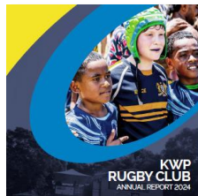
2024 Annual Report