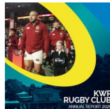
2025 Annual Report